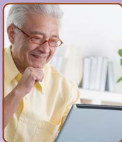
Relay User Types Message

Using a web-enabled PC or wireless device, the relay user types their side of the conversation while the operator reads it aloud to the called party. When the called party responds, the operator types their spoken words for the relay user, enabling them to read the spoken side of the conversation.