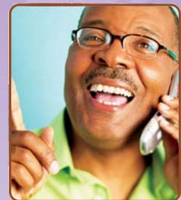
Called Party Uses Any Phone